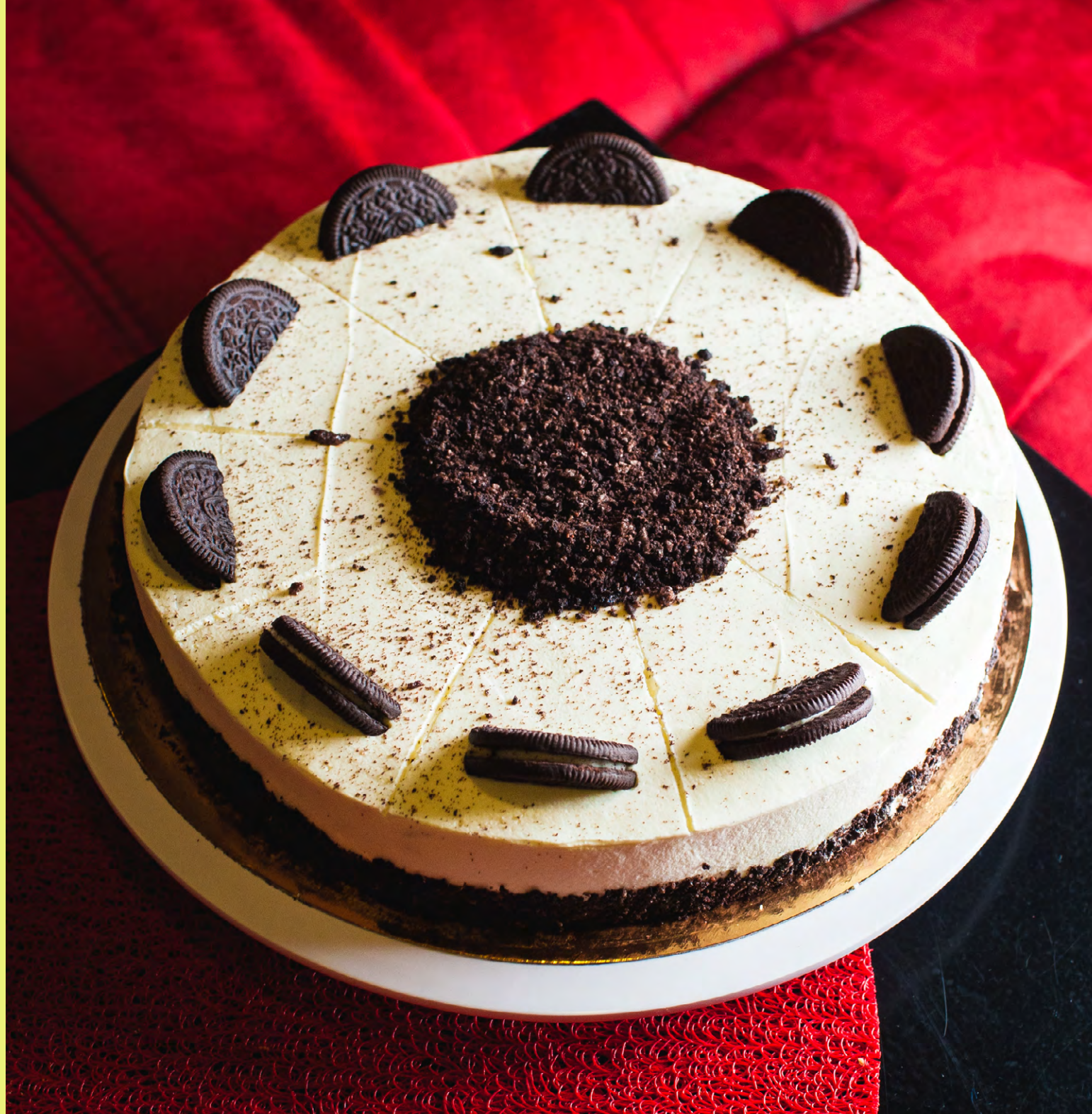
Fluffy oreo cheesecake