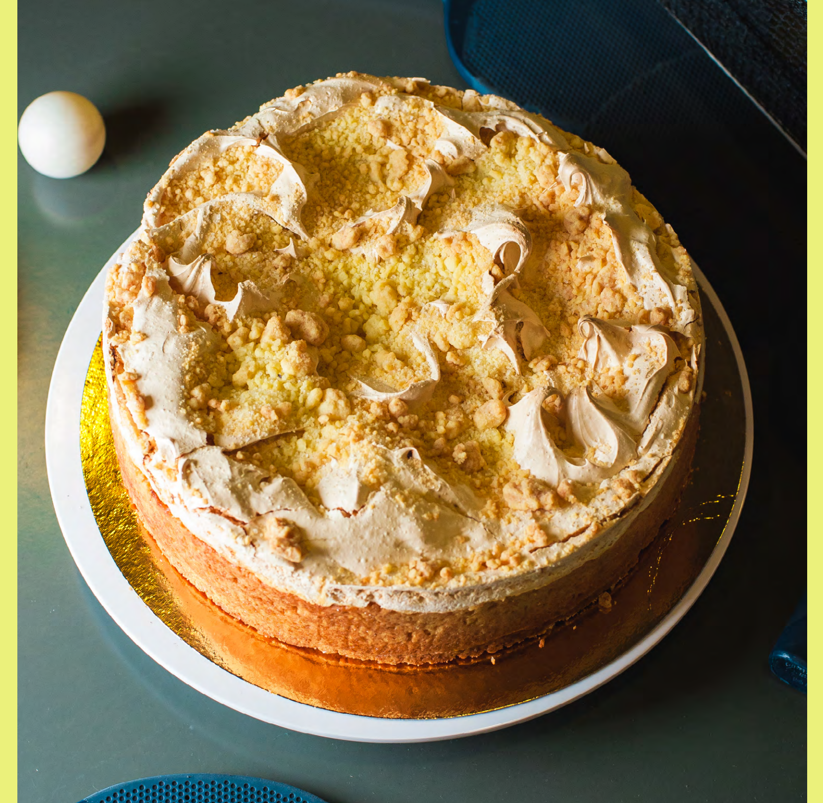
Polish apple pie with meringue