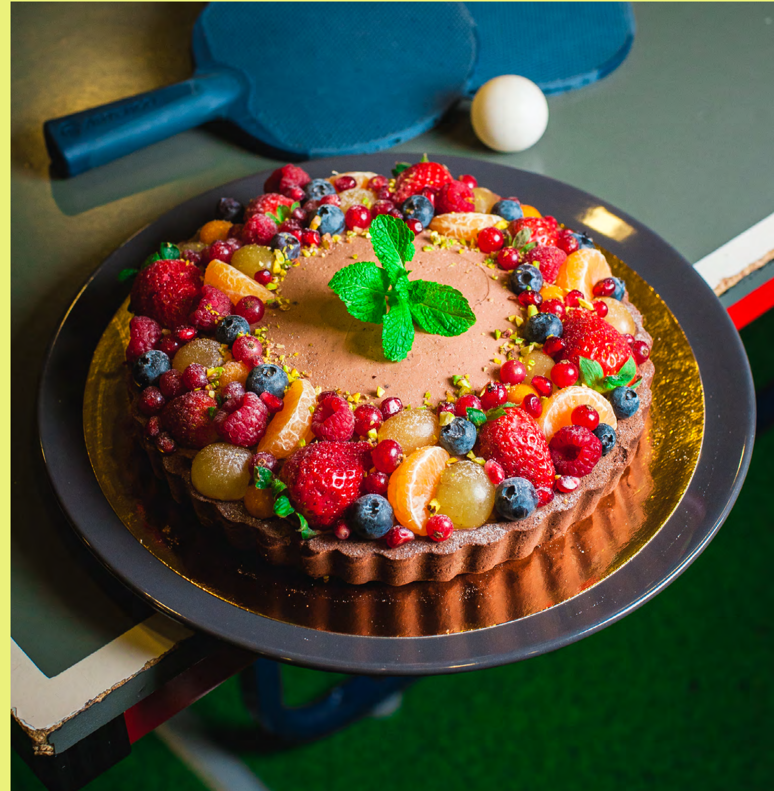
Tart with mascarpone cream with milk chocolate and raspberry mousse