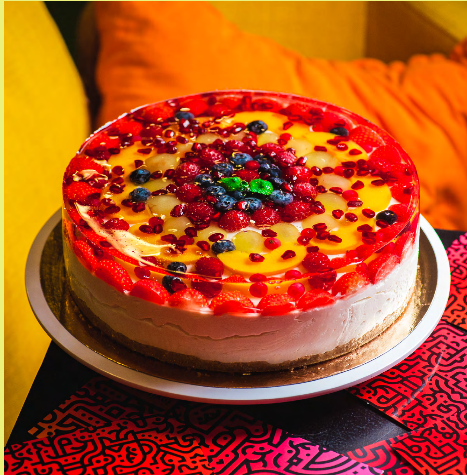
No-bake cheesecake with seasonal fruit