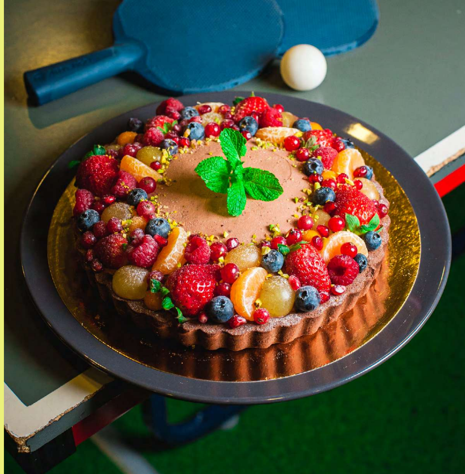
Tart with mascarpone cream with milk chocolate and raspberry mousse